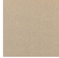
Champagne Cream - 26