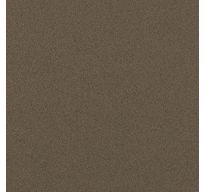
Ancient Bronze - 28